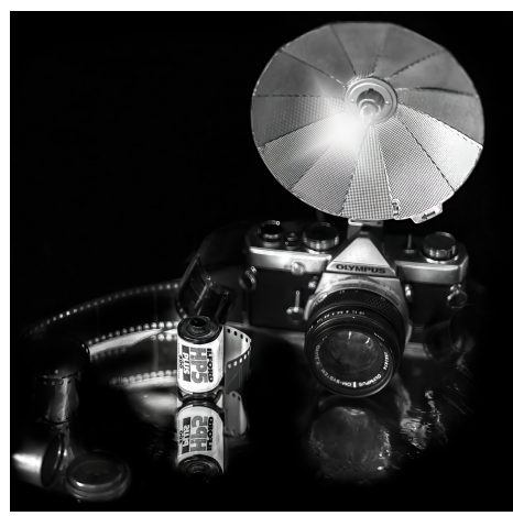
Ilford film - Timeless B&W