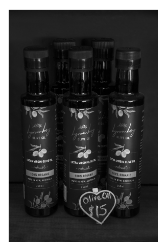
Olive Oil