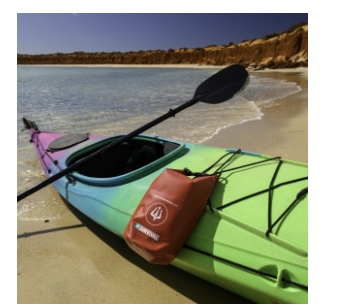
Survival Marine First Aid Kit Accepted Greg Powell