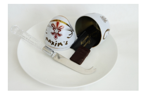
Delights to tempt Accepted Ross Bembrick