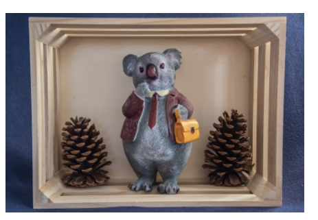
Koala ready to go Accepted Tim Hoevenagel