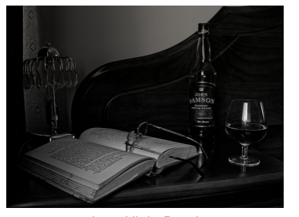
Late Night Read Accepted Bruce Shaw