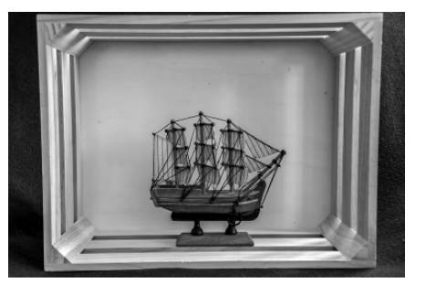
The Old Sailing Ship Accepted Tim Hoevenagel