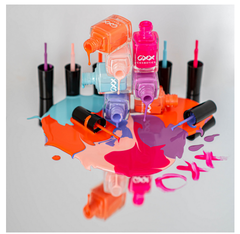
Hugs And Kisses