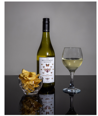
The Butterfly Effect - Chardonnay