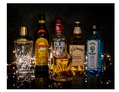
Cocktail Hour Accepted Elaine Duncan